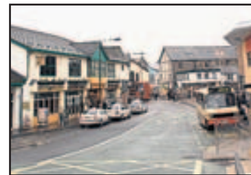
VIGIL: Bridgend is on suicide watch

SAD TOLL THE most common cause of death for young males, suicide rates have risen by more than 50 per cent in the past 20 years.