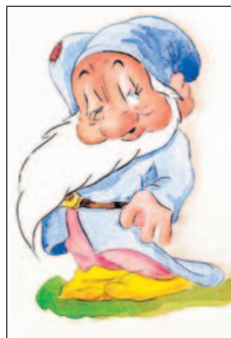
BASHFUL: But is it by Hitler?

LONG-LOST sketches of Walt Disney's lovable cartoon dwarfs Doc and Bashful have been linked to the most unlikely artist - Adolf Hitler.